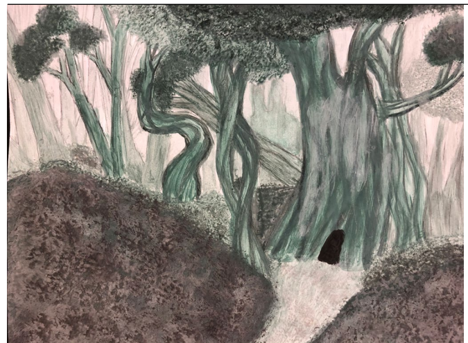
Serena P, Grade 8