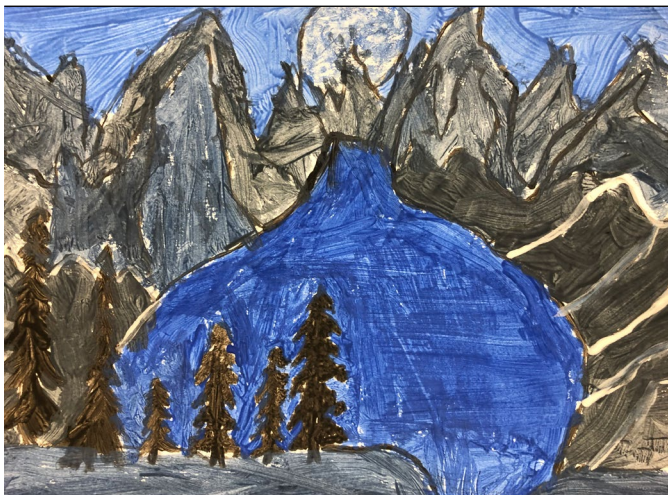
Evan W, Grade 8